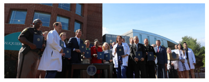
Fauquier Health hosted Virginia Governor Youngkin for his Right Help Right Now bill signing event. This bill seeks to reform the behavioral health system in Virginia by better supporting people in a mental health crisis.